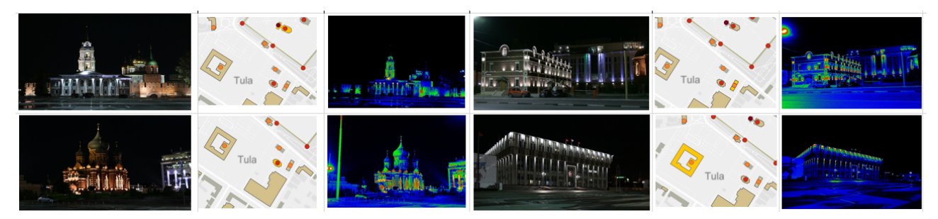
Fig.4 Example of buildings which are forming architectural ensemble of Uspensky Cathedral and Lenin Square.

For the buildings which are forming together architectural ensemble of the Uspensky Cathedral and Lenin Square lighting solution of 2 buildings destroys the architectural facades plastics without forming lighting composition while 4 buildings are emphasized, but without hierarchy of dominants by level.