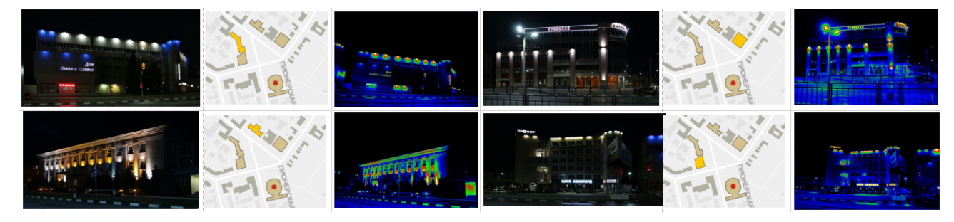
Fig.3 Example of buildings which are forming architectural ensemble around the Gleb Uspensky Square.

facades plastics without forming lighting composition. Facades are visually destroyed by architectural lighting, which creates a strong difference in luminance characteristics that leads to revealing of the characteristic of composition features on the building as it shown in the figure 3.