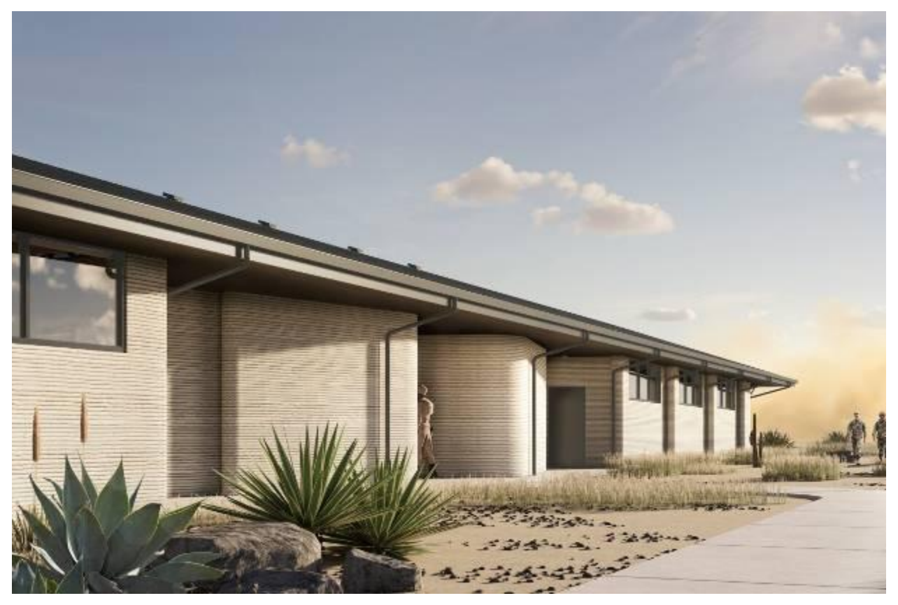
Pic. 5: The project will consist of three barracks, each of which will measure over 5,700 sq ft (roughly 530 sq m) ,Logan Architecture [9]

U.S. Army will be one of the biggest costumer of 3D-printed structure. For example, barracks will be largest in the West. At the next picture is example of barrack for 72 soldiers [8].