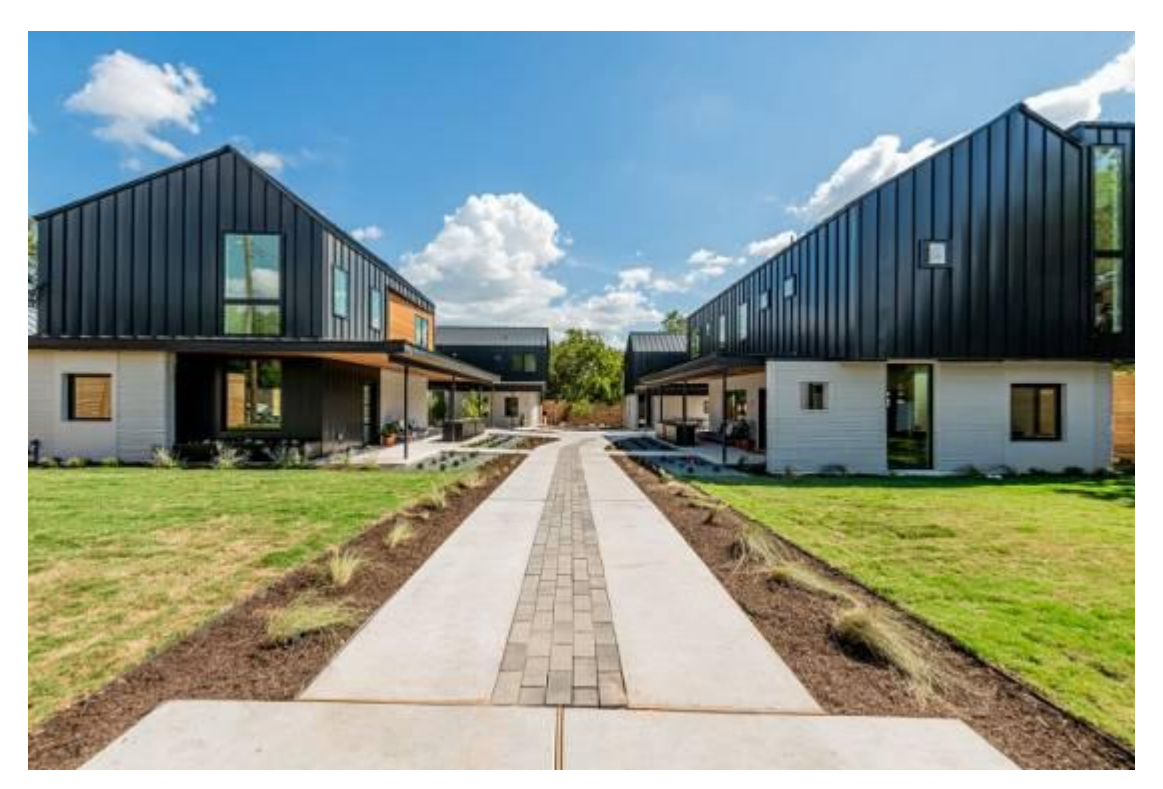
Pic. 3: General view of houses, ground floor created with 3DP in the USA.