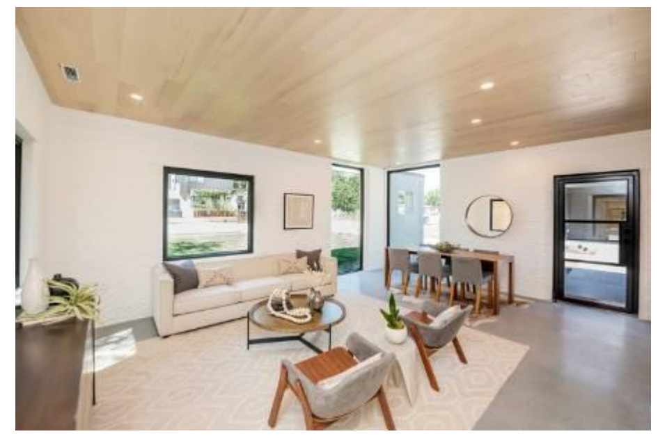
Pic. 4: Interior view of the house.

The project was created in collaboration with 3Strands and Den Property Group, as well as Logan Architecture. While the houses are the first 3D printed homes to hit the US housing market, they almost certainly won't be the last. The